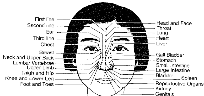
Dia. 3-56 Nose Acupuncture Points